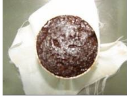
Plate 2: Hemic peat sample

transferred into moisture pressure plate chambers (Plate 4) for soil moisture determination at higher soil pressure -500 cm (-50 kPa) up to -15000 cm (-1500 kPa). A total of seven different suction head (-1, -100, -330, -500, -1000, -3000, -5000, -10000 and -15000 cm of water) were applied to the same samples in order to obtain a complete curve of the soil moisture-pressure head relationship. The treated core samples were weighed in order to quantify the moisture reduction due to the respective suction head. Eventually, at the end -15000 cm suction head, the samples were oven dried for soil moisture determination. Two different drying temperatures were applied. First, 60°C, according to Lambert and Vanderdeelen (1996) and second at 105 °C (ASTM, 1999). The soil moisture data were plotted against matric suction head to produce moisture retention curve of the sample.